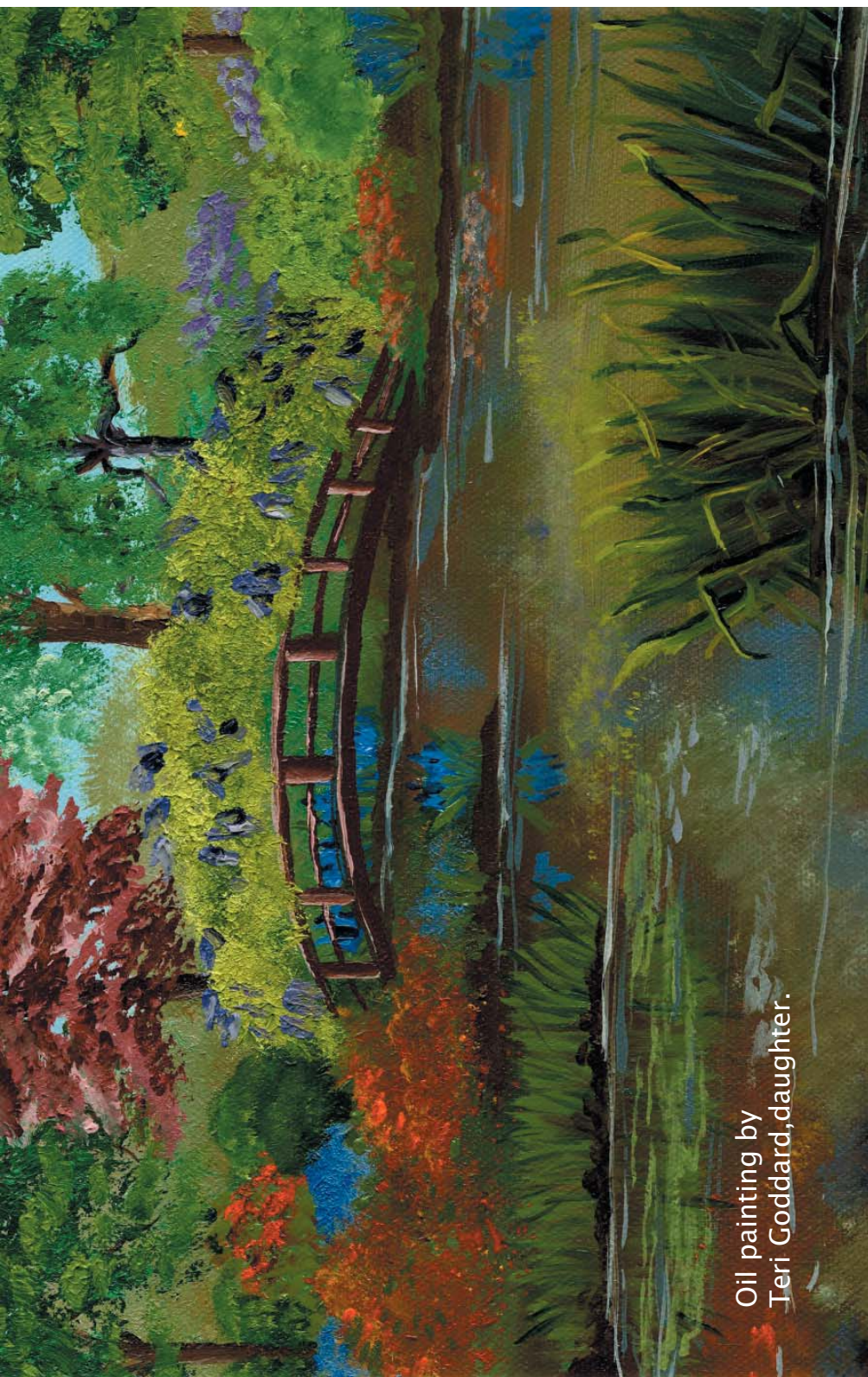
Oil painting by Teri Goddard, daughter.